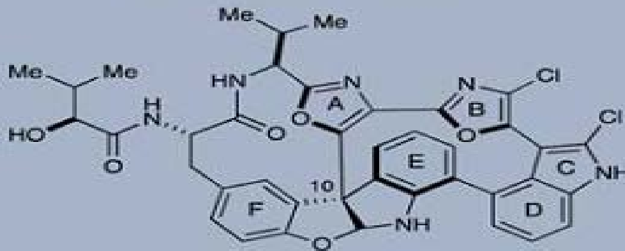
diazonamide A (1)